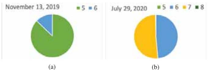
Figure 7. Distribution of the necessary number of ATCOs for (a) November 13, 2019, and (b) July 29, 2020.

We highlighted the importance of developing meteorological products tailored to the needs of airports staff planning.