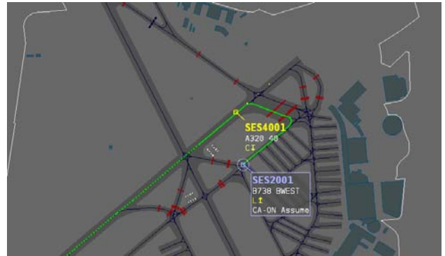
Figure 2: LUP/LND alert in SDPS display (first image), neutralized after SES4001 passes the runway entry of SES2001 (second image)

Tower runway controllers enter relevant information such as holding points, assigned thresholds and clearances via the FDPS HMI. For example, the typical “next” clearance according to standard procedures at the airport can be entered by clicking on the square at the very left of a flight strip.