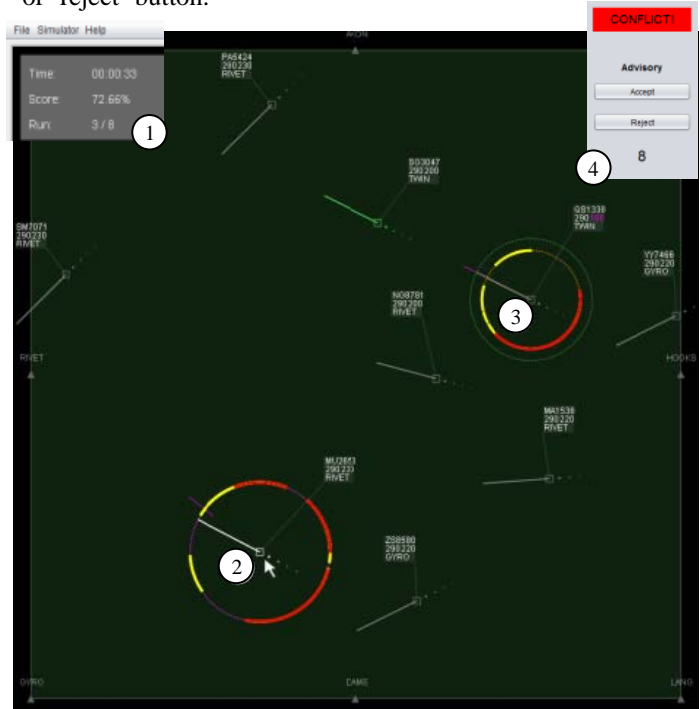
Figure 1. The ATC simulator showing: 1) the current performance score, time, and runs to go, 2) the SSD of the currently selected aircraft in magenta, 3) the SSD with an automated resolution advisory in an amber colour (suggesting a speed decrease to resolve a future conflict), and 4) the advisory dialog window that the controllers could use to either accept or reject the advisory.

Dependent variables focused on acceptance of the advisory, the controller’s agreement with the advisory (measured on a zero to one-hundred scale), response time, and subjective workload ratings (measured on a zero to one-hundred scale). Response time was measured from presentation of the resolution advisory to pressing the ‘accept’ or ‘reject’ button.