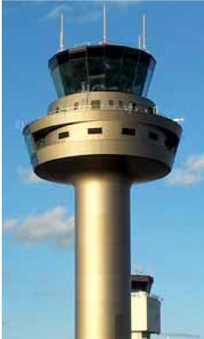
Salzburg TWR, implemented 2014