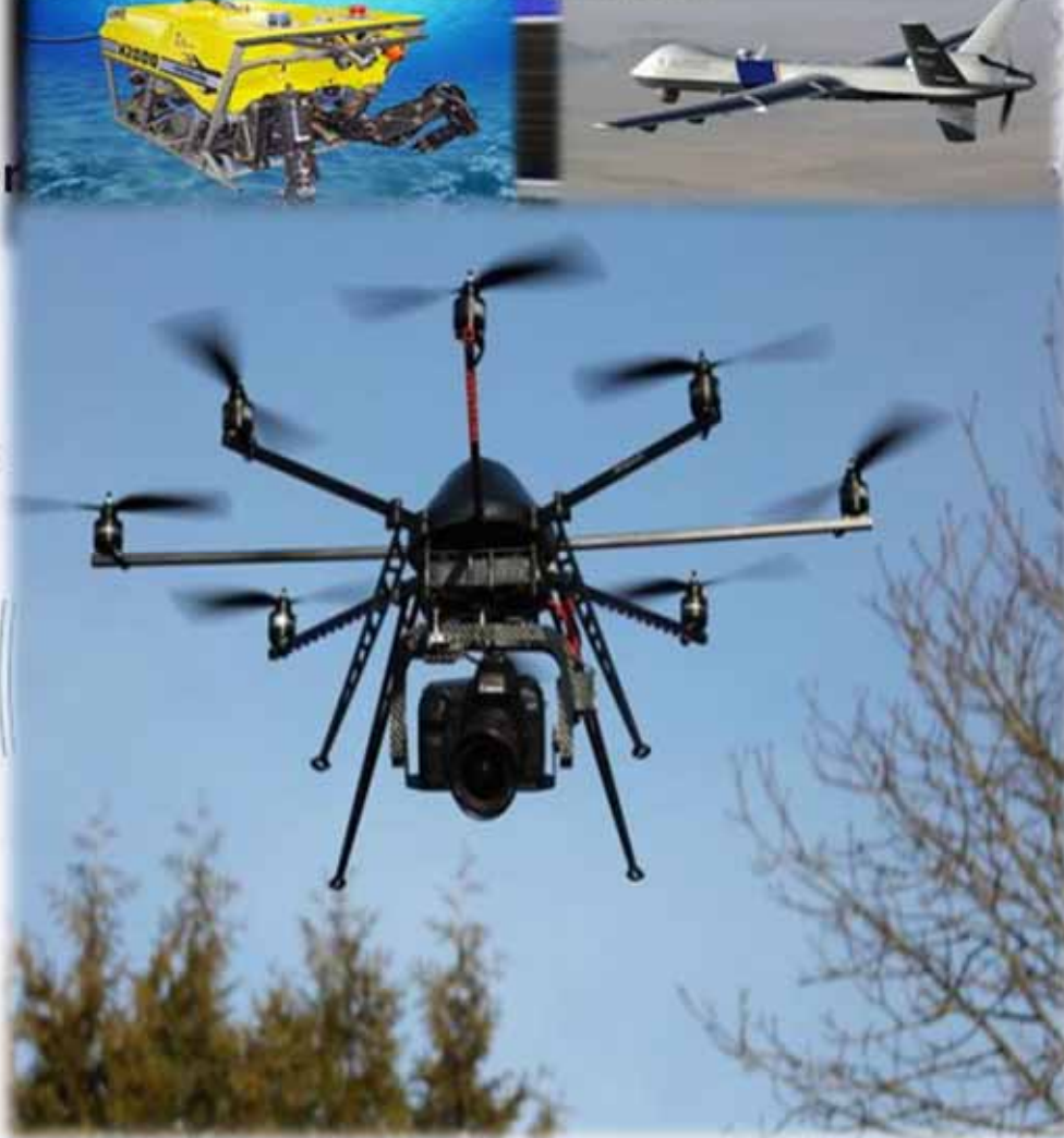
Rockwell Collins Enhanced Vision System