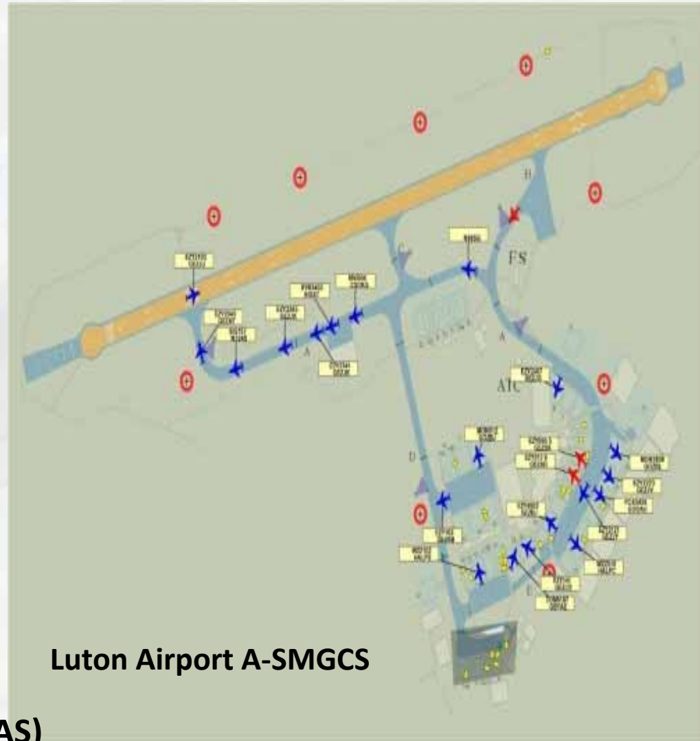
Luton Airport A-SMGCS